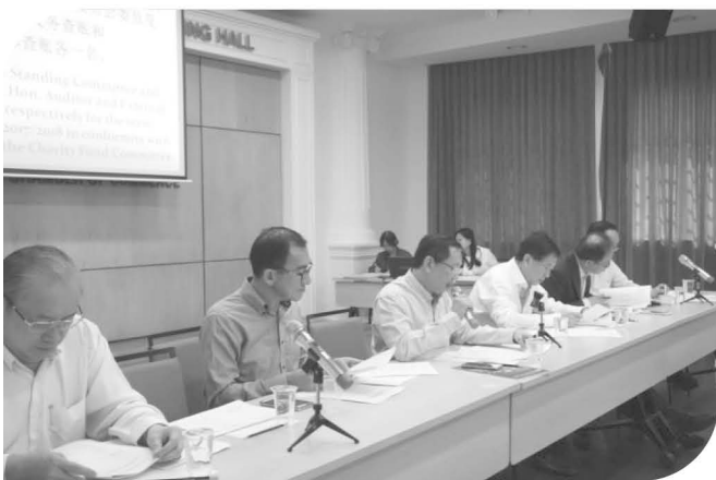
05/08/2016 檳州中華總商會慈善基金委員會會員大會 General Meeting of the PCCC Charity Fund Committee