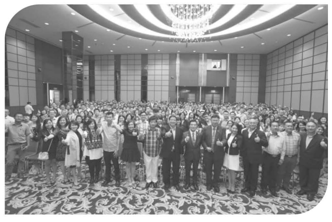
08/08/2016 《人財兩富》講座會 “Prosperous Both in Humanity and Capital” Seminar