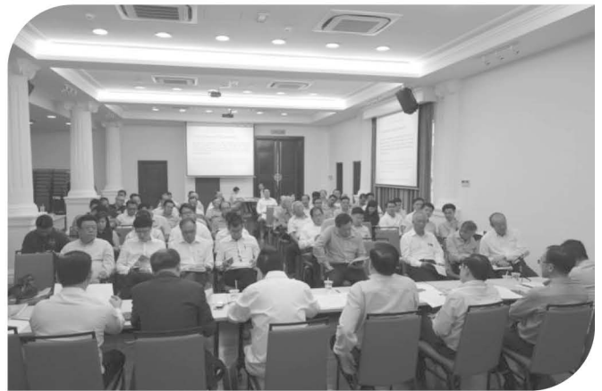
05/08/2016 檳州中華總商會常年會員大會 PCCC Annual General Meeting