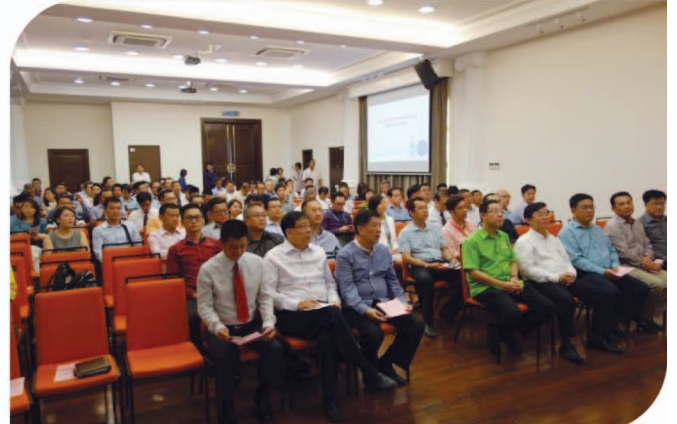
槟州副首席部长拿督莫哈末拉昔礼貌拜访槟中总 Courtesy Visit by Dato' Haji Mohd Rashid, Deputy Chief Minister of Penang