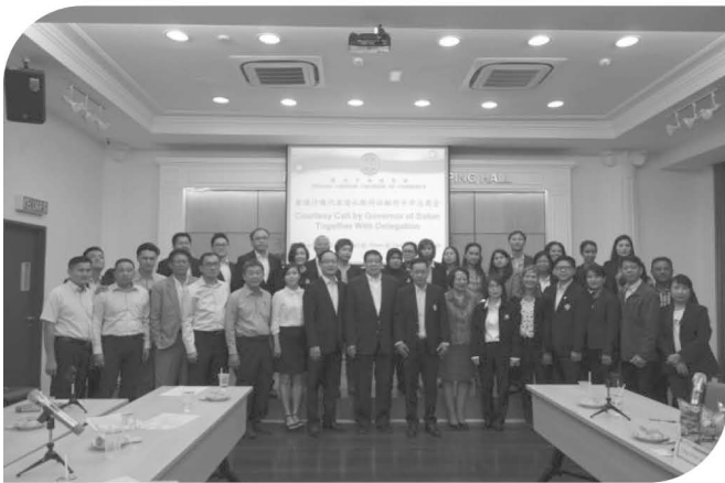
01/08/2016 泰國沙敦代表團禮貌拜訪檳州中華總商會 Courtesy Call by Governor of Satun with the Delegation