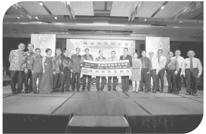
27/07/2016 籌募恒毅國民型華文中學峇央峇魯分校建校基金晚宴 Fund Raising Dinner for SMJK Heng Ee Bayan Baru Branch